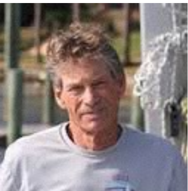
Don Wigston Windcraft Multihulls