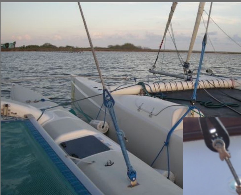
Colligo's Innovative Rigging