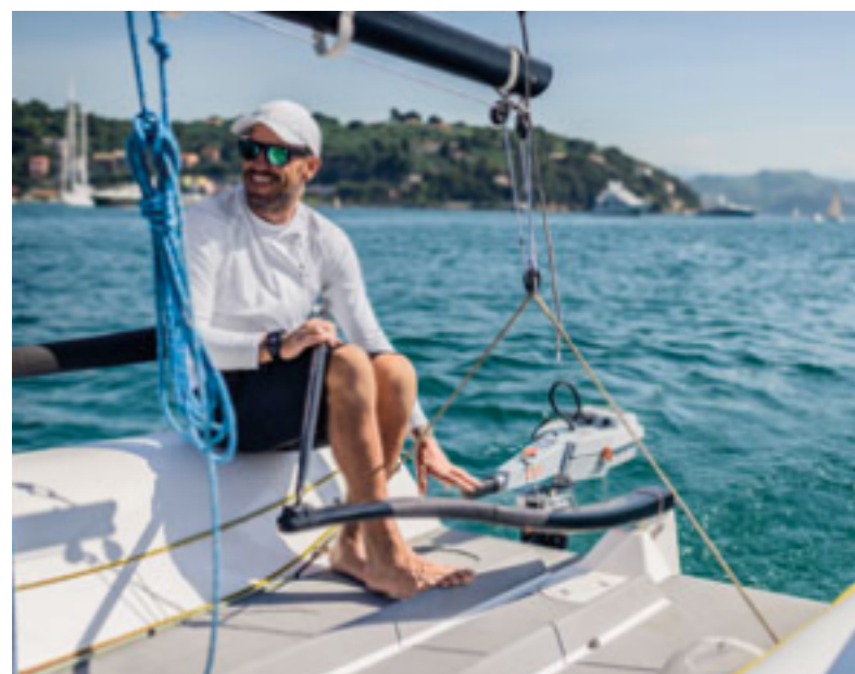
Torqeedo Electric Motors