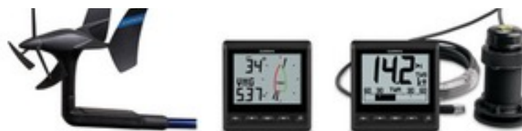
GARMIN GNX™ Wireless Sail Pack with Wireless Masthead Sensor, Two Displays, and Depth Transducer