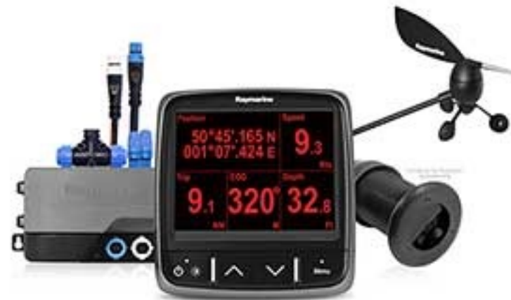
Raymarine i70 System Pack with Wind, Depth and Speed Transducers